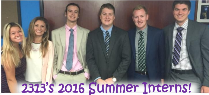
2313's 2016 Summer Interns!